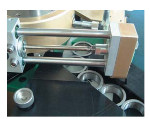
The rings are transported from a belt to the crack test system.

The system is designed to be very space-saving and by means of rollers can be moved and connected to different production lines.