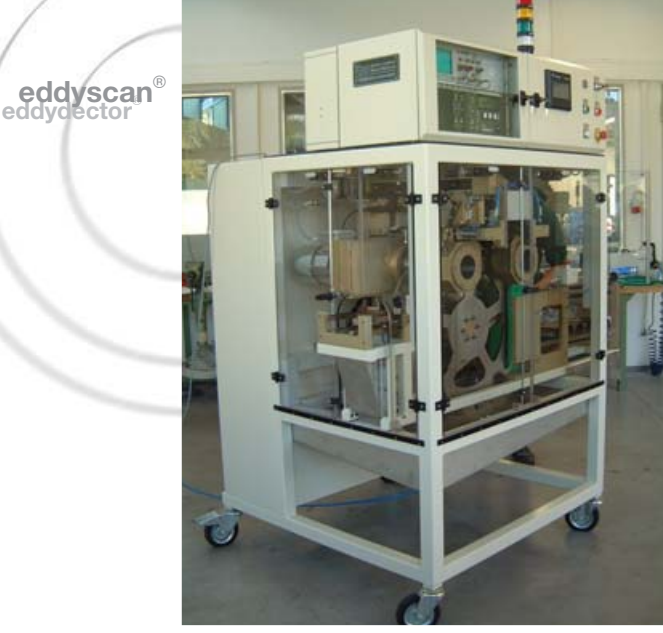
Overall view of test system.