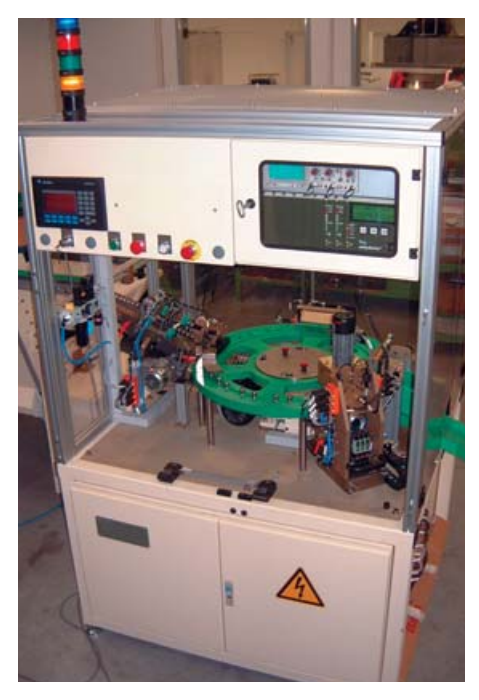
Test system with crack test station in twin design. On the left-hand side in the photo: Feeding and separation. On the right-hand side in the photo: The OK parts leave the system via the chute. The NOK parts are sorted out in the middle of the back-side

A test system, as shown in photo on the righthand side for example, automatically tests up to 6,000 ball studs per hour for surface cracks and correct heat treatment. The ball studs are tested either after the forming process or after the succeeding metal-cutting processing. The parts are fed individually onto the rotary indexing wheel which moves the parts first to the crack test station and then to the structure test station. Further test stations such as e.g. dimension test, thread test etc. are options that can be added to the system. Depending on the sorting decision the test part is sorted to the OK or NOK chute.